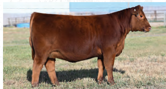
RED DOUBLE B LARKABA 124 Full Sister