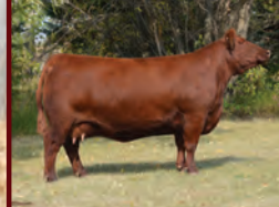
LARKABA 42A Maternal Grand Dam

Larkaba 42A's impressive track record of generating sale topping sons and daughters across the nation truly speaks for itself, so when we had a pair of Razor x 42A flushmate sisters a few years back, we knew they had to stay at our place. One of them was Larkaba 9010, the cow we had immense success with this past summer and fall on the show circuit, and the other was 108's dam, Larkaba 9013. 108's rugged yet attractive herd bull presence, raw shape, and stoutness should be extremely valuable in generating low input, powerful cattle with a maternal lineage that just flat out works every time.