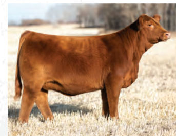
WBC BROOKE 3J Maternal Sister