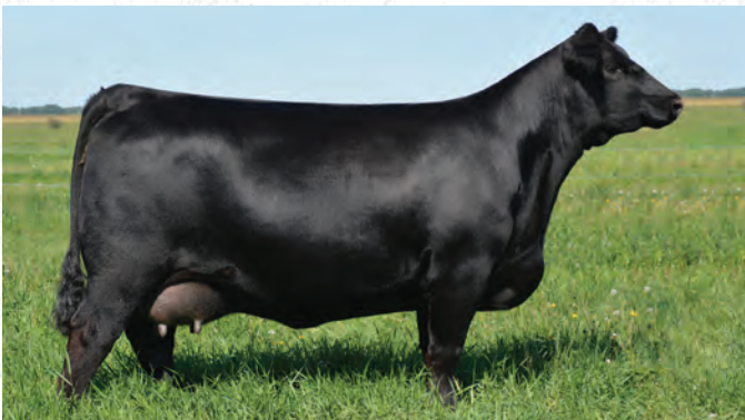
BAR-E-L ERICA 74A Maternal Grand Dam

We are proud of the way Erica 74A has shaped our program and whenever Erica presents herself in a pedigree it begs your attention. The Erica 267F dam of this calving ease sire now resides at Golden Oak Livestock in Alberta and is the lead donor in their program. Grab hold of a little Erica for yourself.