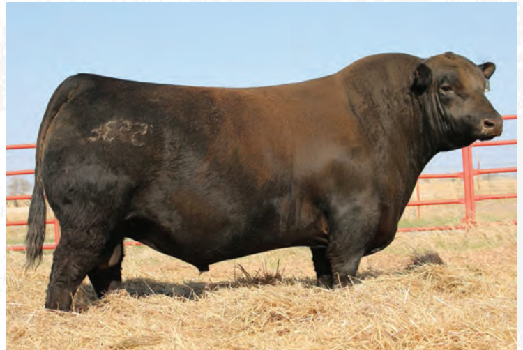
BLAIR'S MARTIAL LAW 593E

Maternal Sibling & $37,000 USD daughter of Blair's Martial Law 593E