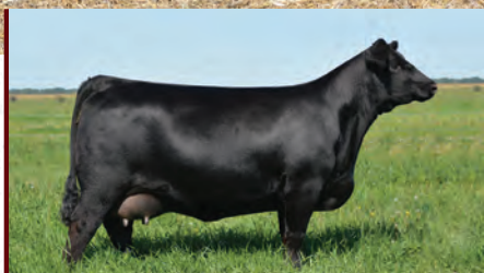
BAR-E-L ERICA 74A Dam

Blair's Capacity 805J is a SimAngus two year old that has the popular RF Capacity and the great Bar E-L Erica 74A. If you want a Simmental sire to cover a large group of cows & raise females that have the great Erica 74A influence then look no further. Expect the daughters to be the kind that make the neighbors stop to have a look.