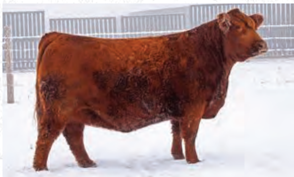
RED BLAIR'S SCREAM 530E Dam