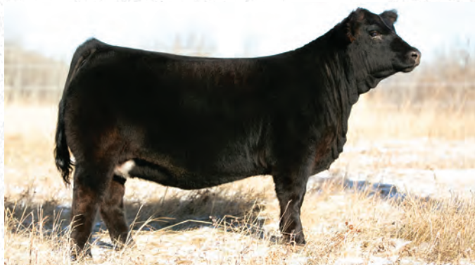
WBC BROOKE 1H Paternal Sister