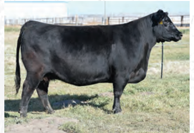
BLAIR'S SUGARLAND 320E Dam

Red Blair's Kargo 101J has that combination of proven red genetics in Kargo 215U and the proven outcross black genetics on the bottom side in Soo Line Locomotive 1403. You can expect outstanding udders on the daughters. Check out the dark red color and the tight sheath on this female maker. The black/red carrier dam recently sold in Opportunity Knocks 3.0.