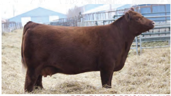
RED BLAIRS PRICILLA 44Z Maternal Grand Dam