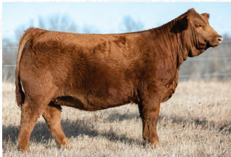
BLAIR'S WESTBROOK SCREAM 811J Maternal Sister