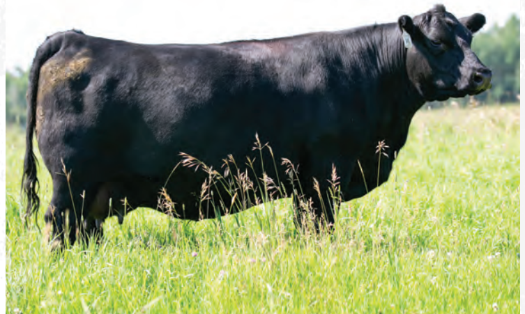
BLAIR'S ERICA 267F Dam