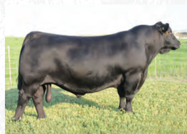
S A V RENOWN 3439 Sire

Here is your chance to add some serious power and royalty to your program. Blair's Renown 585J is a flush mate to the three full sisters that averaged $17,500 in the recent Opportunity Knocks 3.0 sale. The PM Echo 8'16 Supreme Champion donor dam is a beast of a female that proves her value every single time. There is no such thing as too much SAV Renown 3439 and we believe this mating will have a lasting impact on your program.