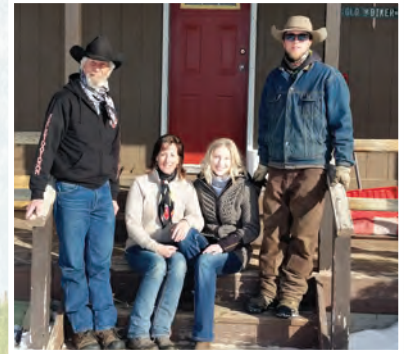
The Jackson Family