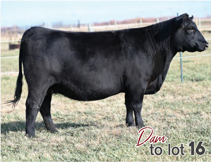
Dam to lot 16