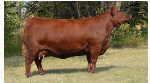
RED BLAIR'S LARKABA 42A Dam

If you've seen any of 114's full sisters, you'll never question the generating potential stemming from this mating. Larkaba 9010 was one of the most dominant show females this past summer and fall, and Larkaba 124 was a featured lot in the 2021 Opportunity Knocks sale to Macie Weigand of Iowa. 114 has been a standout in the pen for his perfect foot shape, muscle, and power with a deep, dark cherry haircoat that all red breeders are after.