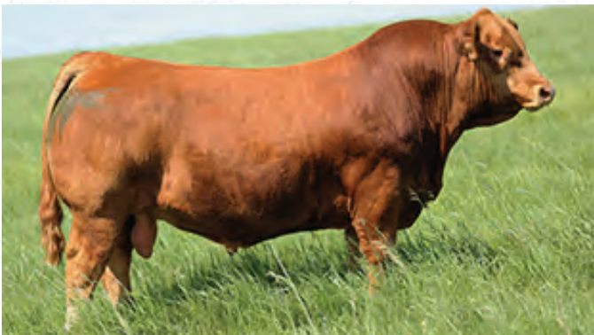
SVS BETTS 808F Sire