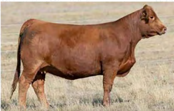
MAF SHAMROCK 210H Dam