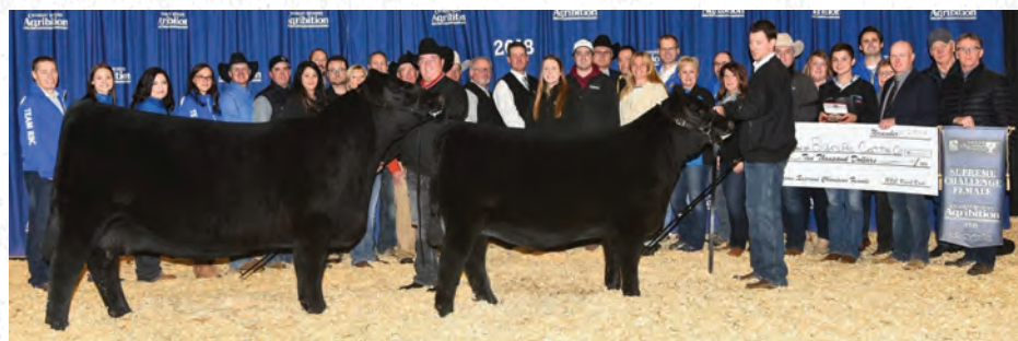
RBC Supreme Female 2018