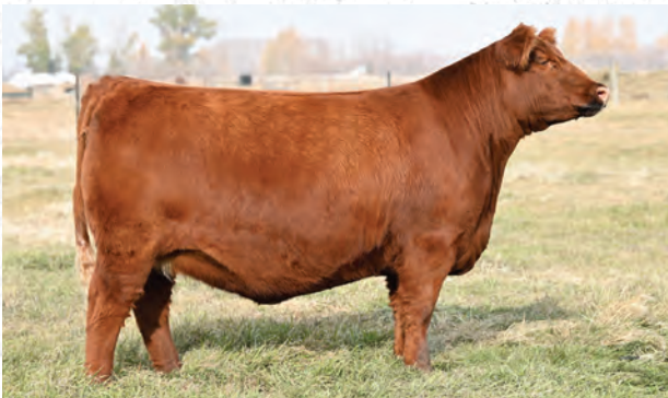
RED BLAIR'S YANKEE 112J Full Sibling