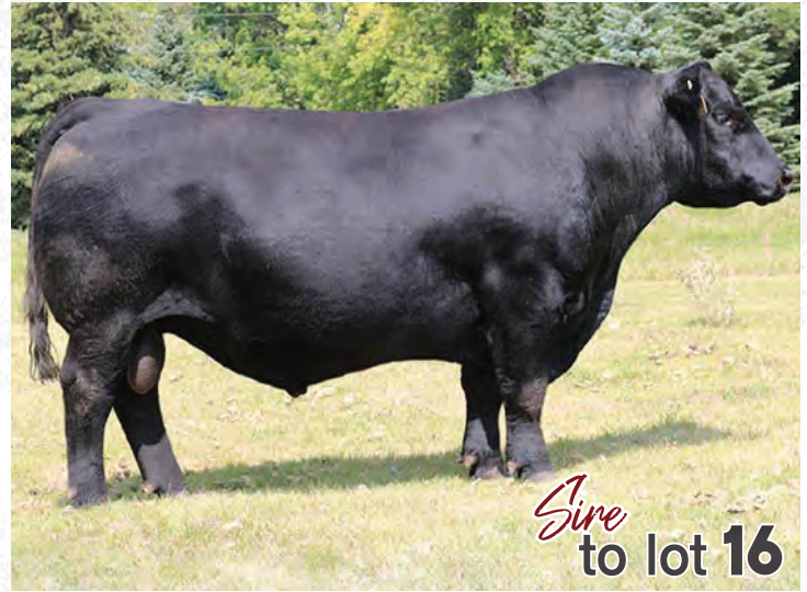
Sire to lot 16