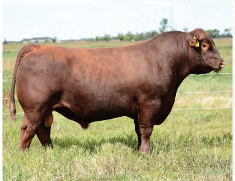
RED COCKBURN ARSENAL 8001 Sire

Look deep into this pedigree and you will love what you see. It will be cool to see the calves with Arsenal x XO Crowfoot 0102X in the pedigree.