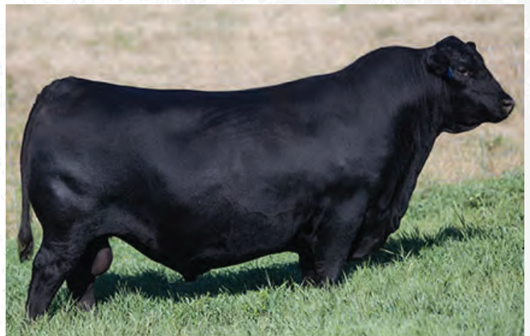
S A V RENOVATION 6822

Lots of muscle and performance in this rascal.