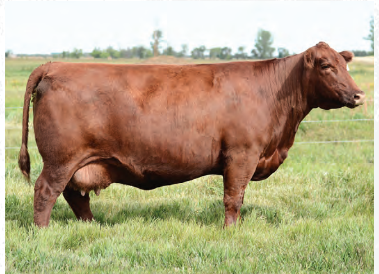
RED BLAIR'S YANKEE 79C Dam

Red Blair's Arsenal 161J is one to spend some time on. His sire Red Cockburn Arsenal is a full brother to the $71,000 Red Cockburn Assassin and the Red Blair's Yankee 79C dam is a full sister to the $60,000 USD Red Blair's Bingo 581B. Study the picture, study the video and then hop in your truck.