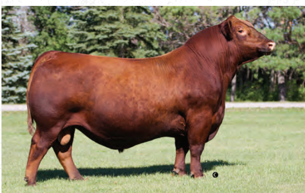
RED DOUBLE B LUCKY STRIKE 9001 Sire