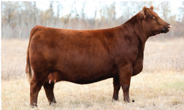
LARKABA 9010 Full Sister