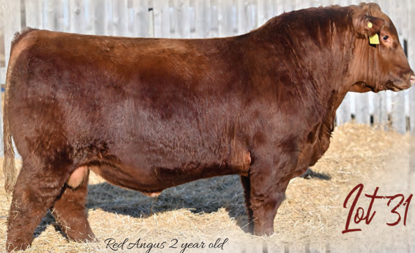
Red Angus 2 year old