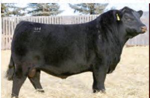
HF ALCATRAZ 60F