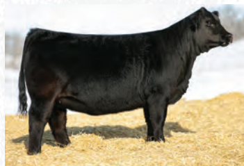
WESTBROOK BROOKE 3K Flush Mate