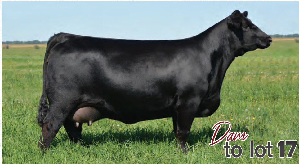
Dam to lot 17