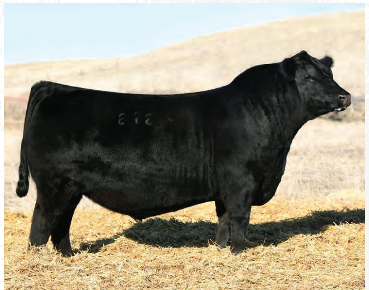
COLEMAN BRAVO 6313 Sire

This bull is sure to have some fans on sale day. A Bravo out of a Resource daughter, lots of predictability in this pedigree. He's deep sided, easy fleshing, and moves like a cat. Will sire those females with that extra capacity.