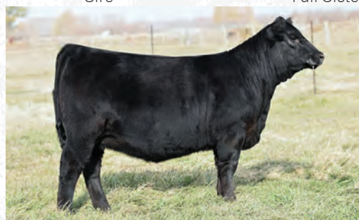
BLAIR'S ECHO 542K Full Sister