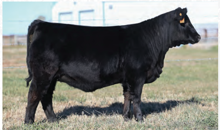
BLAIR'S 236 FORJANDORA 542J Maternal Sister