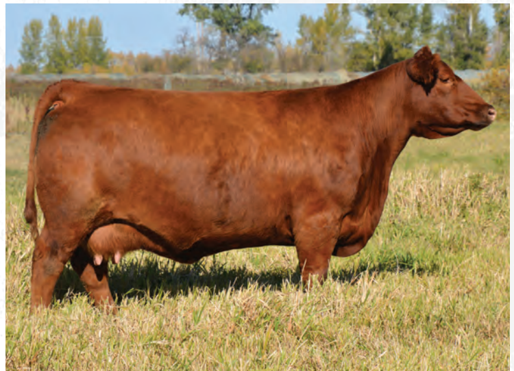
RED WSF MS YANKEE 13T 12W Dam