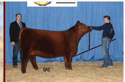
LARKABA 42A Maternal Grand Dam

Get in on the chance to purchase the first ever son stemming from the 2018 National Champion Red Angus Female, Red Rainbow Lark 9E. I could fill a pasture of daughters with the Lark cow family's moderation, low input body shape, and quality look, and 109 has the power to do just that.