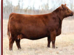
LARKABA 9010 Full Sister to Dam