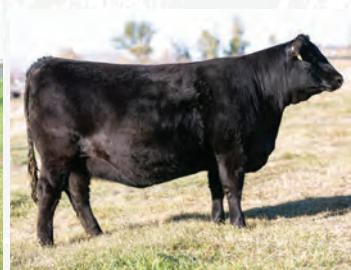
BLAIR'S ECHO 572J Full Sister