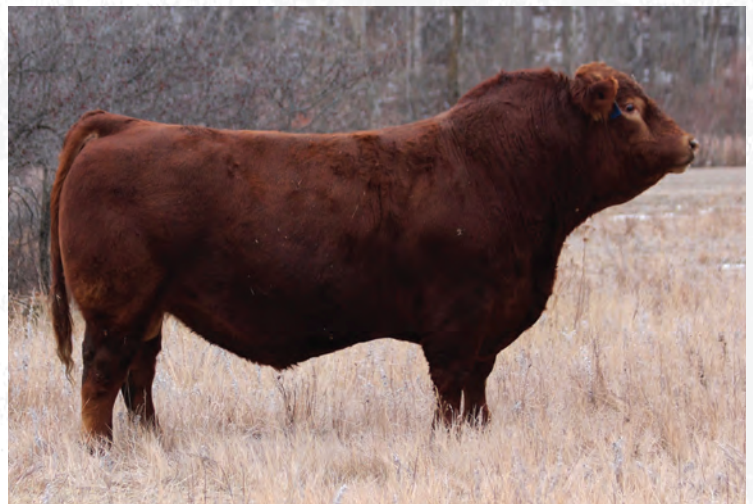
WS EPIC E152 Sire