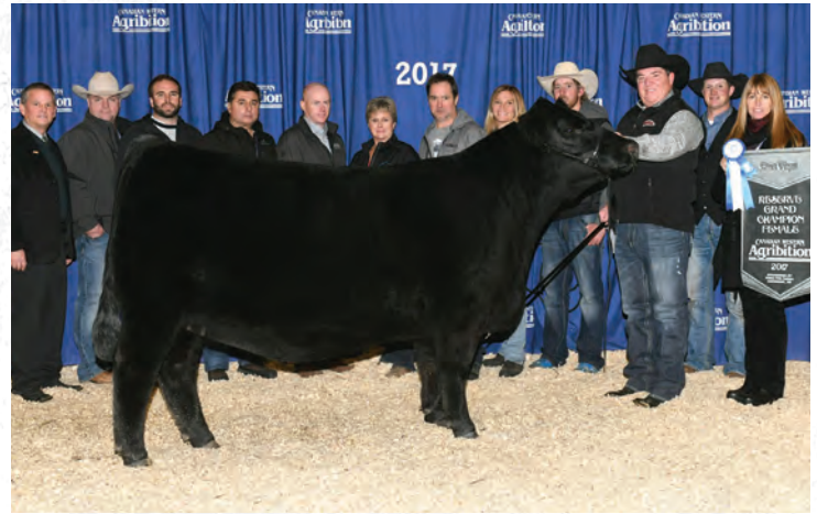
Reserve Champion Female CWA 2017