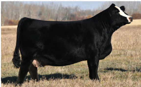
RF Scream 974G Full Sister