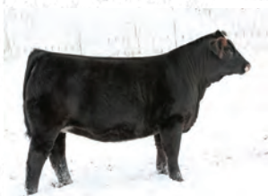
BLACK GOLD MS SODA POP 162E Dam