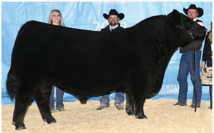
DMM INTERNATIONAL 54D Sire

Sired by the Supreme Champion Bull DMM International 54D. This bull is full of red meat, and puts it all together in a real attractive package. If you're looking to add those pounds to your calves this is the one to do that. Check him out on sale day.