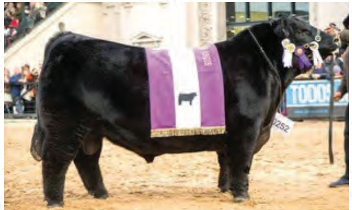
ERRE TE 383 CONDOR EURO Sire

A full sib to Lot 11 and you will definitely see the consistency in this mating once you see the brothers together.