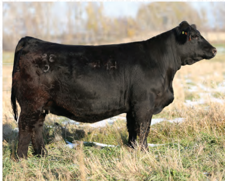
LFE BS CHARO 38C Dam