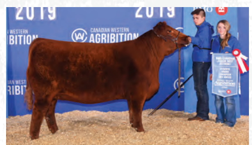
RED DOUBLE B PRISCILLA 3F Dam

102's ability to combine a double digit calving ease figure with tons of rib and substance on an awesome set of feet and legs is something we find rather unique. Yet, it's his pedigree that may be his most valuable asset. With Lucky Strike and Larkaba 42A on the top side, and one of our favourite Priscilla 44Z show heifers on the bottom, this past division winner at Canadian Western Agribition is a perfect representation of the impact that our two most profitable cow families have had on our program.