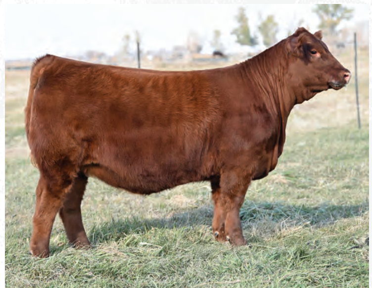
RED BLAIR'S DM RHONDA 105K Paternal Sibling

This loose hided rascal is destined to be the ultra efficient kind. The Tommy Jack influence really adds a nice touch and I think udder quality on the daughters will be exceptional.