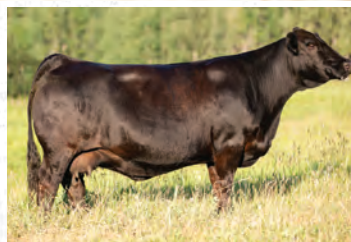
JR BROOKE Dam