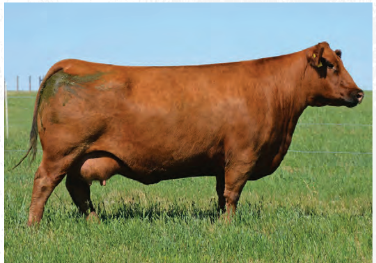
RED SSS JESSIE 261Z Dam