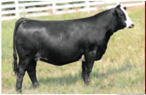
BLAIR'S WESTBROOK FINESSE 809H