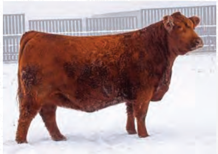
RED BLAIR'S SCREAM 530E Dam