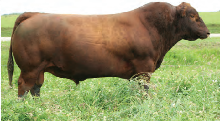
RED RINGSTEAD KARGO 215U Sire

Consistency in type, calving ease and predictability of performance is what you should expect from the Kargo son's that have a shot of Warcraft and Yankee 12W.