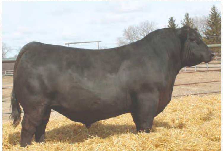
ELLINGSON PROFOUND 8155 Sire

The first of several Profound sons I have in the sale offering. These Profound sons all have a great spread from birth to weaning. Dam of this bull is a never miss cow. She has had six sons to date. This is her fifth son to sell and her 2022 calf is in the pen for next year. Great heifer bull candidate here.