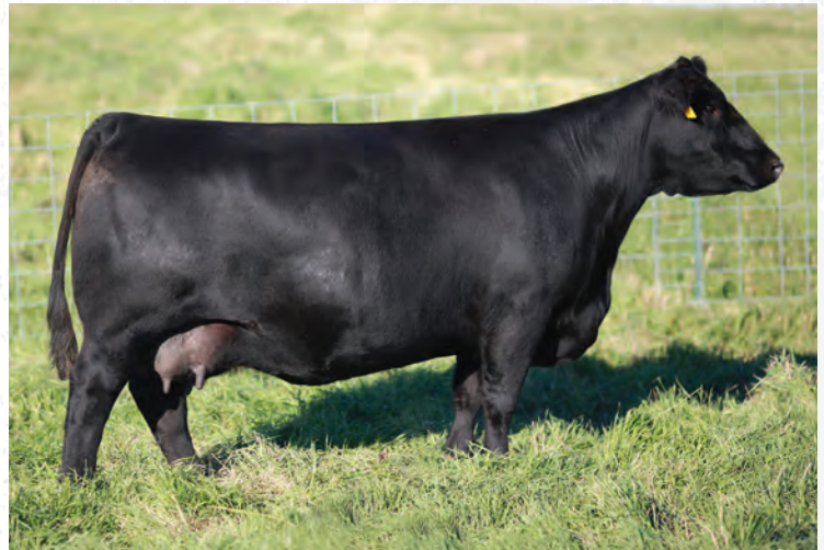
SOO LINE ANNIE K 9165 Dam