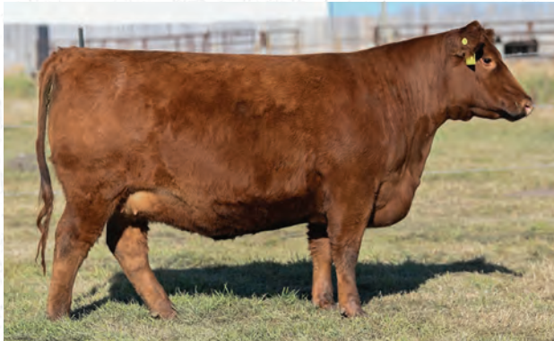
RED BLAIR'S JESSIE 148J Maternal Sibling

The $41,000 SSS Jessie 261Z donor was special to us but we lost her far too soon. This is some of the very last Jessie 261Z genetics to sell and we feel very confident that the combination of Red Box, Soldier & Brylor Big Rock is something special. He is dark red, big ribbed, tight sheathed and well balanced. He has been a pasture favourite all summer and for good reason.