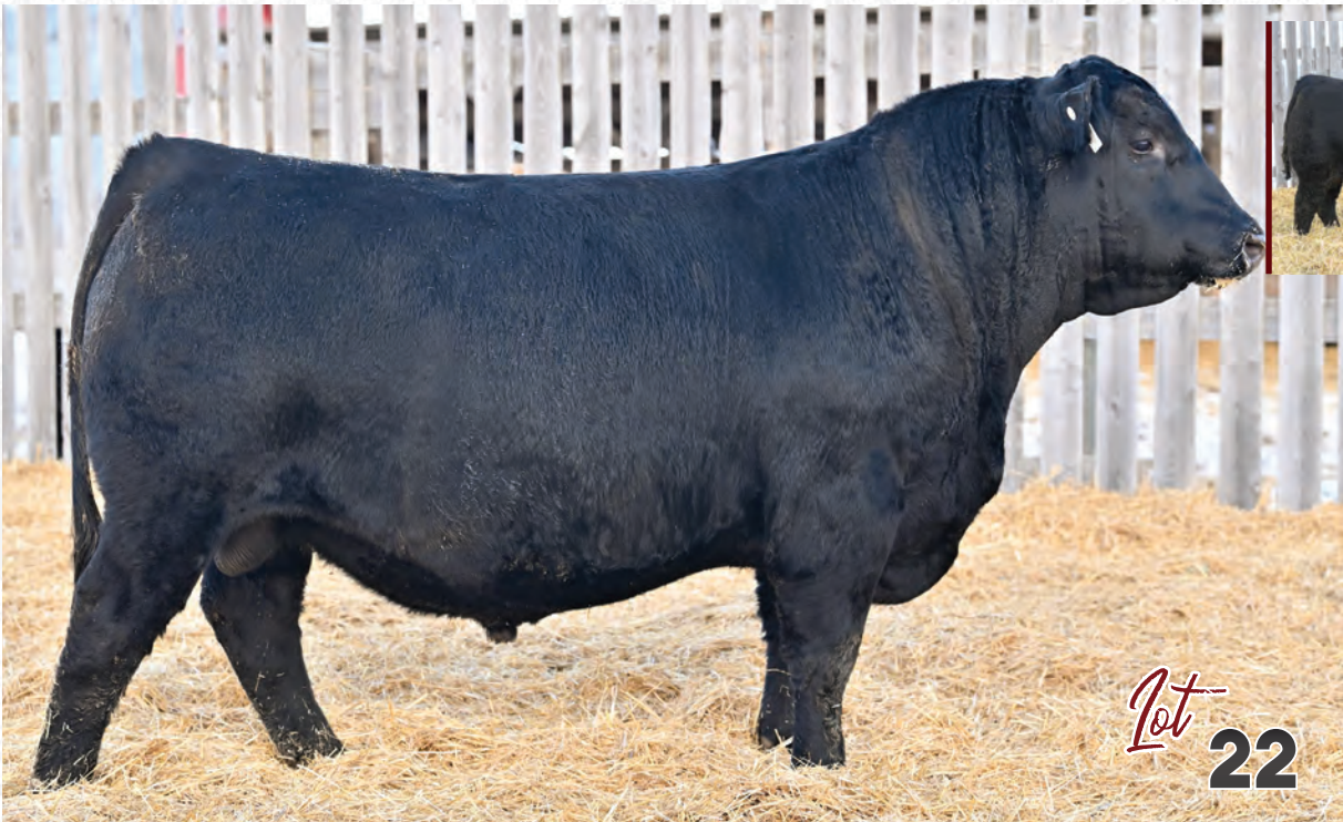
CCCJ FORTUNATE 94F Sire

This is a big strong Fortunate son, with some scale and muscle. The Dam 7C, has been a very consistent producer.