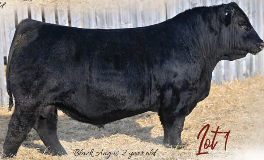
Black Angus 2 year old

TUESDAY, FEBRUARY 7, 2023 • 1:00 PM Jackson Cattle Co. Sale Facility Sedley, Saskatchewan