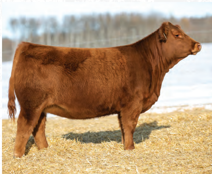
BLAIR'S SMARTY PANTS 851K Paternal Sister